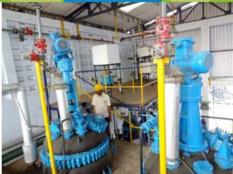
ENVIRONMENT FRIENDLY SUSTAINABLE MANUFACTURING TECHNIQUE

Alcatraz Chemicals is an ISO 9001:2015 & 14001:2015 certified company established in Vadodara, India. Over the last 33 years we have become the leading manufacturer of Specialty Chemicals and Intermediates for Pharmaceutical and Metal Finishing Chemicals In India. In 2018, we have further developed some new high quality Intermediates for Pharmaceutical and Electronic applications and all these developments are a result of our in-house R & D by the dedicated team.